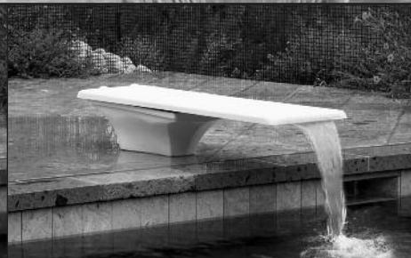
La Mesa w/Duro-Beam aquaBoard™ w/BOARD FALL