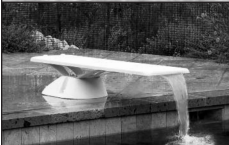
Edge Diving System w/Edge aquaBoard™ w/BOARD FALL

Visit inter-fab.com to view our installation help video. (Video does NOT replace installation instructions.)