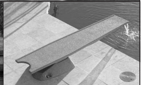
T7 Diving System w/BOARD FALL