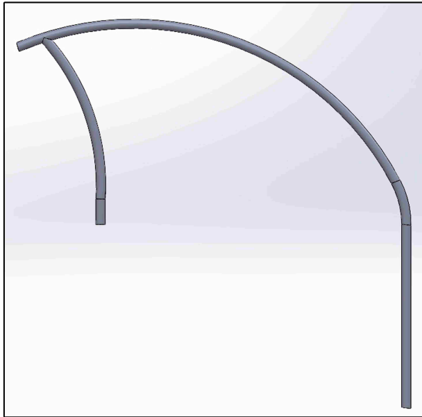
MODERN 4' STAIR RAIL